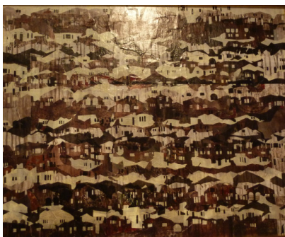
Highly Commended Cat 1 “Suburban Dream