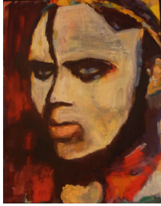
‘Colours in Black’