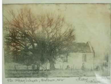
“St Mary's Church Goulburn”