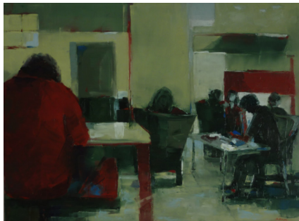
2 nd Prize Cat 1 – Common Room Study in Red and Green