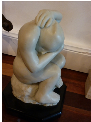
2 nd prize Cat 3 ‘Deep Sadness’