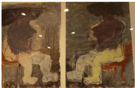
1 st Prize Cat 2- 'Engagement'