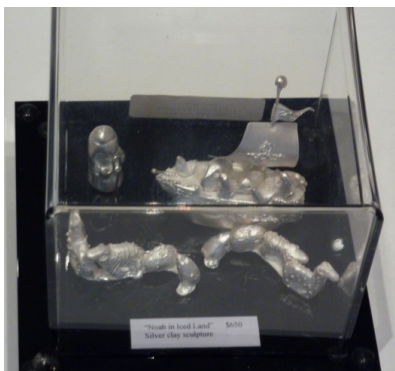
Cat 3 commended “Noah in Icedland”