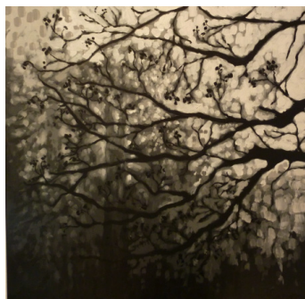
“In The Thick of It’