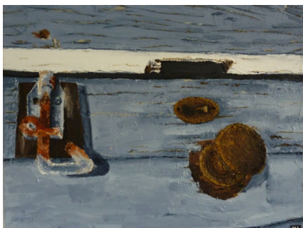
1 st Prize Cat 4 ‘Rusted Opportunities’