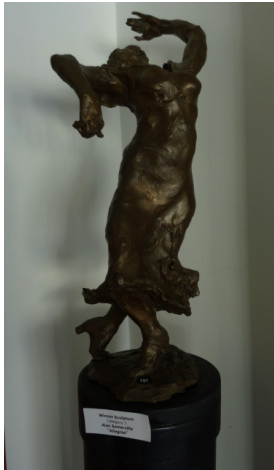
1 st Prize Cat 3 –‘Allegras’