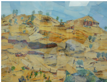
Commended Cat 2 “Past Tulibigeal”