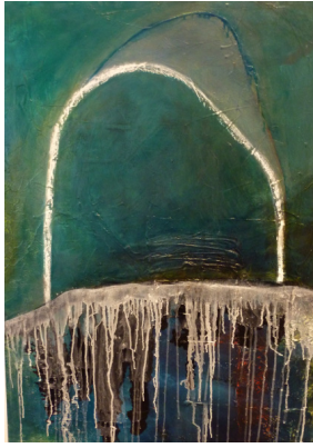
“Whitewater n. in frothy water