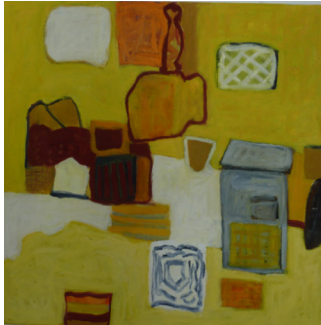
1 st Prize Cat 1- Moving Day